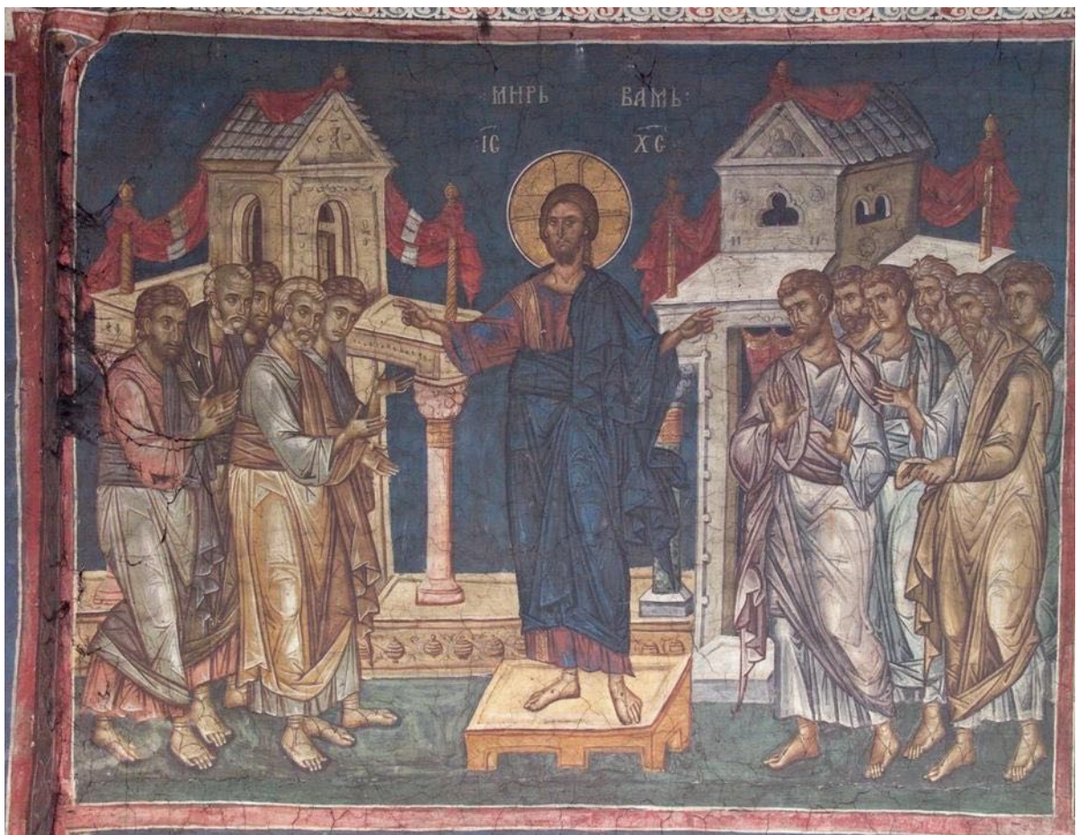
Fresco from Decani Monastery of Christ appearing to the Apostles after the Resurrection