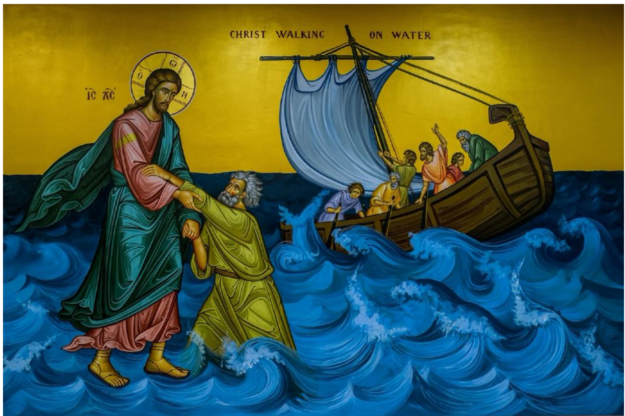
Baptistry icon from St Antonios Antiochan Orthodox Church, Halifax (Canada)