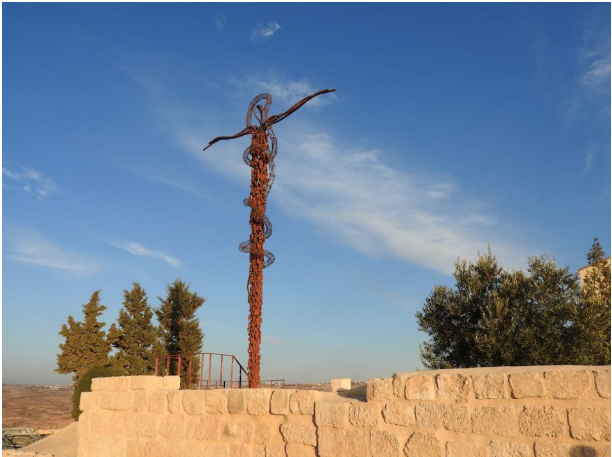
"Bronze serpent" monument at Mt Nebo in Jordan.